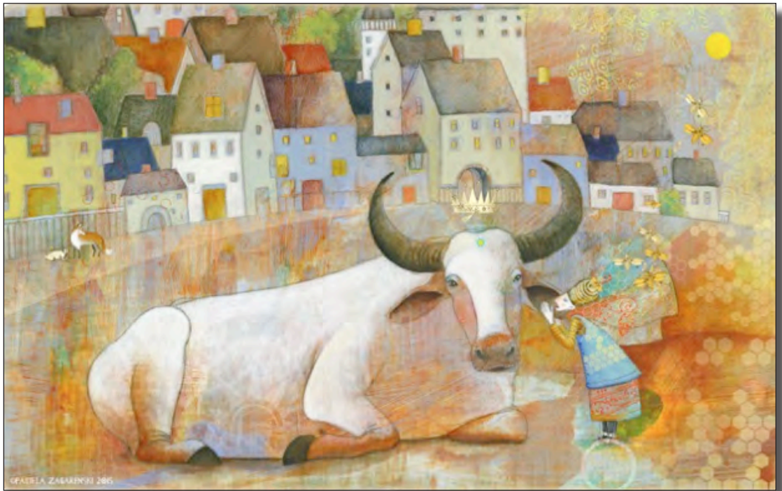
Illustration from The Whisper , by Pamela Zagarenski [ www.sacredbee.com ]

Then Fox began to tremble. For he had begun to see that Great Ox himself was silence. It seemed to radiate from him in an enveloping cloud. That was scary enough. But now, as his thoughts almost disappeared, Fox could see that he too was basically silence. Can silence ever be afraid of anything, Fox wondered? Can anything overcome silence? Could anything be more alert to what might be done for his family, than silence?